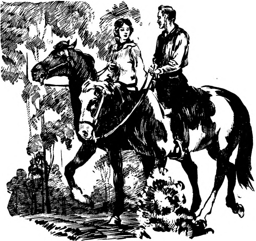
At sight of him she straightened in her saddle.

"Seven miles out of town," somebody answered.